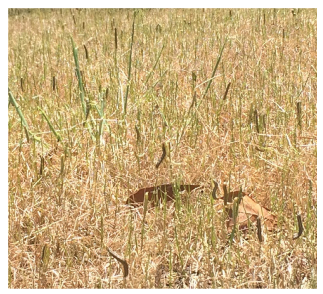
Fall armyworm population in the non-managed turfgrass

Keep the life cycle of the fall armyworm in mind when handling complaints. Sod that has been established for months before becoming infected with armyworms is not the responsibility of the sod producer or installer. Armyworm moths are continuously flying and are attracted to young succulent grass, so infestations of newly sodded lawns are common for 30 to 60 days after establishment. The practices associated with establishment, like irrigation and nitrogen fertility, promote growth characterized by succulent leaves. If armyworms are identified and controlled early, turfgrass recovery can be expected without needing to replace the sod. Caterpillars that show up within a threeto four-week timeframe are of uncertain origin, and may require some compromise to maintain customer satisfaction. As fall approaches, the armyworm life cycle typically lengthens, changing developmental timing. Similarly, shorter days and cooler temperatures slow turfgrass growth.